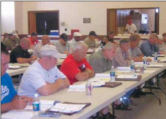
Seen here are attendees from Local Unions in Ohio and West Virginia at the shop steward class on June 21, 2008.

Some of the topics covered in the training session were: grievance preparation, Weingarten Rights, the Seven Test for Just Cause, discipline, Union's right to information and past practice.